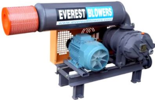
Twin Lobe Air Blower