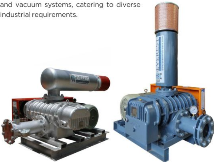
Tri Lobe Air Blower

Everest offers high-performance blowers and vacuum systems, catering to diverse industrial requirements.