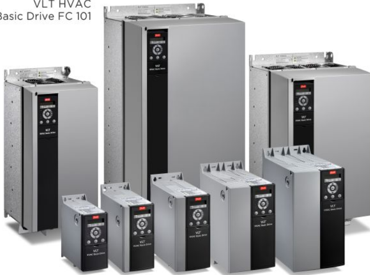
VLT HVAC Basic Drive FC 101