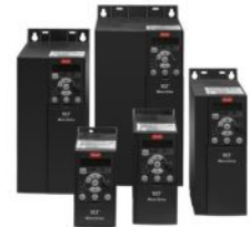
VLT Micro Drive