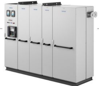
LT & VFD Automation Panels

Danfoss is a global leader in energy-efficient solutions, providing advanced drives and controls for various applications.